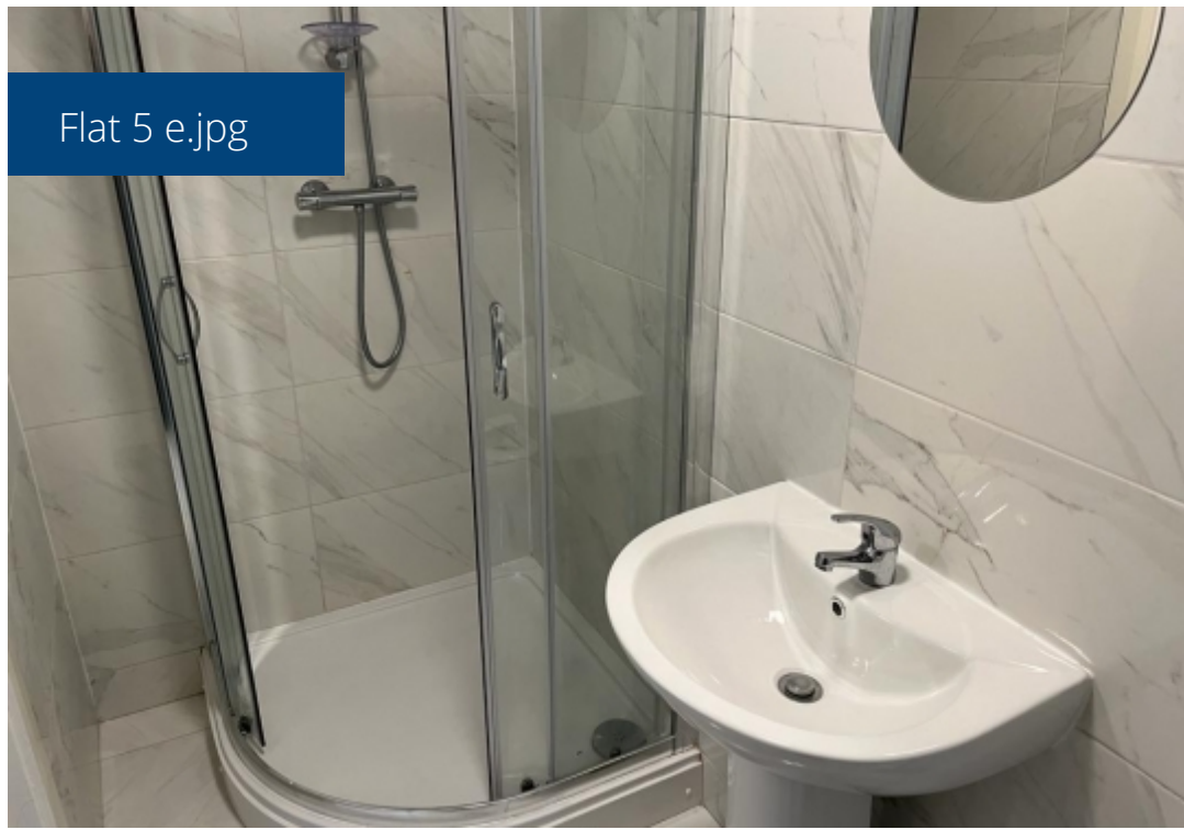
Flat 5 e.jpg