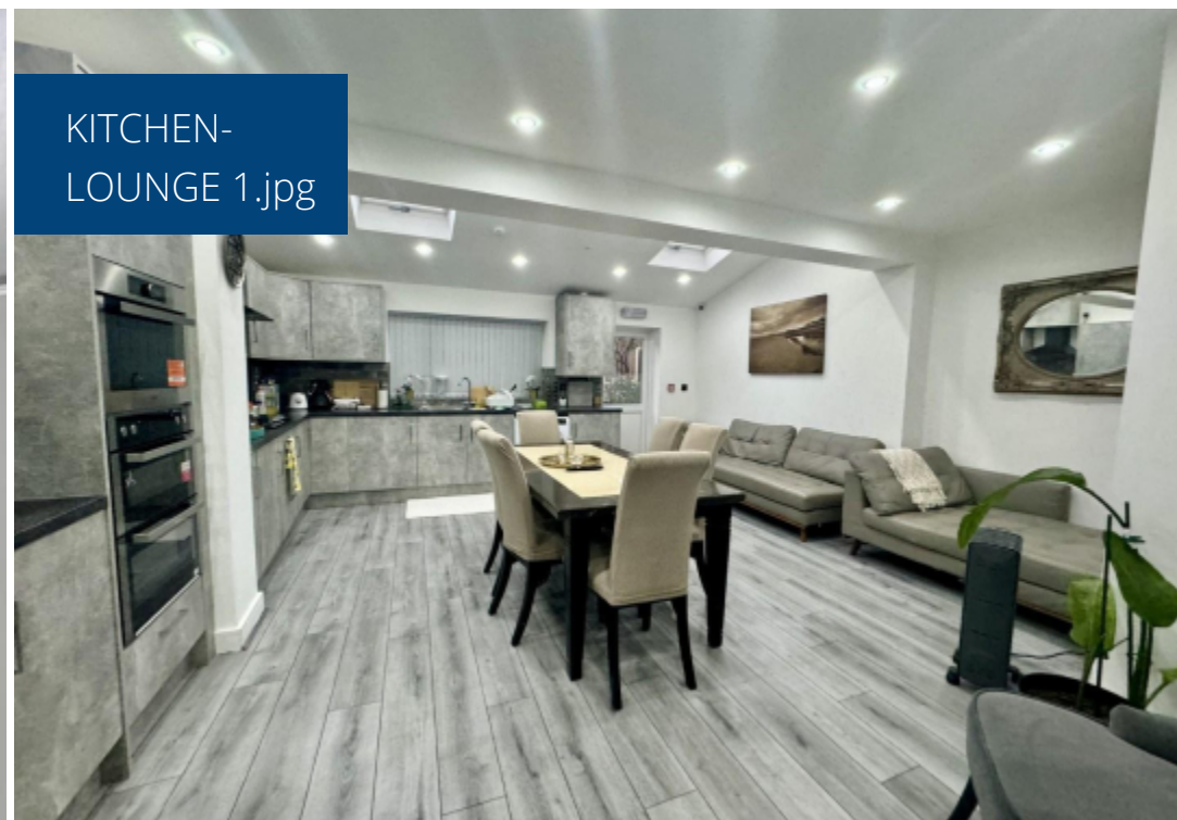
KITCHEN- LOUNGE 1.jpg