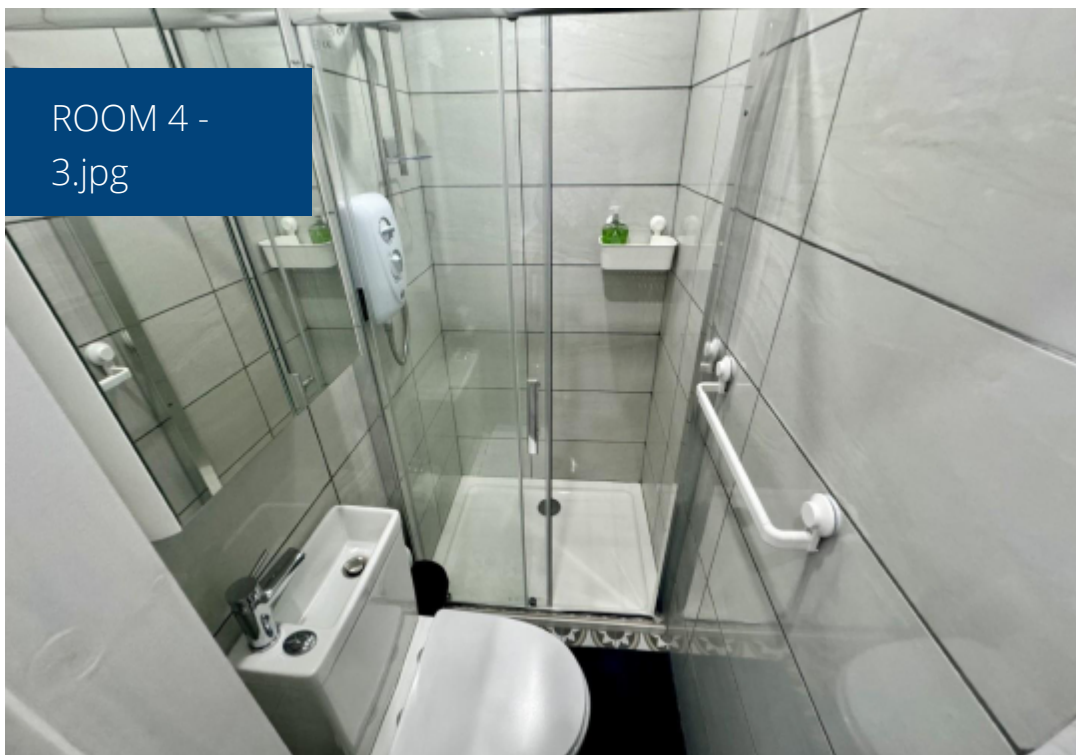
ROOM 4 - 3.jpg