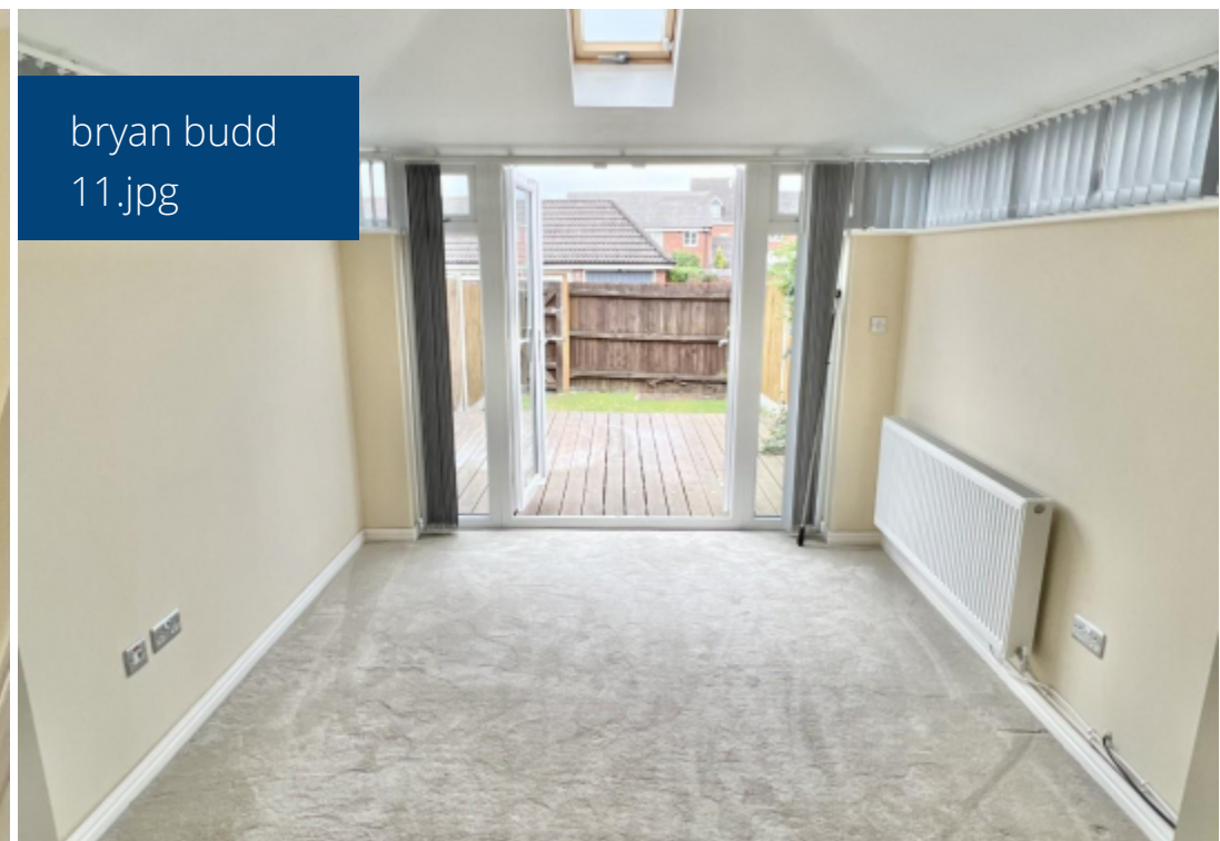
bryan budd 11.jpg