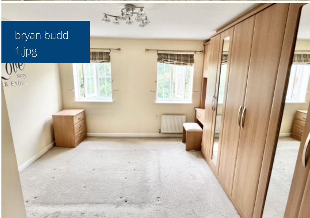
bryan budd 1.jpg