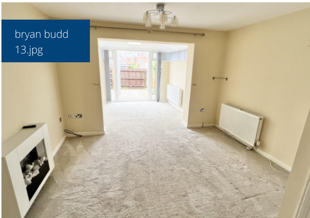
bryan budd 13.jpg