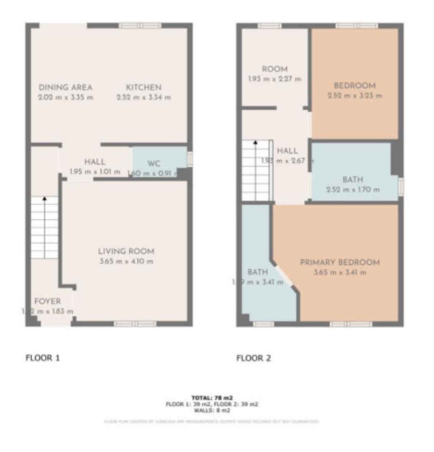
This floorplan is for illustrative purposes only and the location of doors, windows and other items are approximate.

Agents notes: All measurements are approximate and for general guidance only and whilst every attempt has been made to ensure accuracy, they must not be relied on. The fixtures, fittings and appliances referred to have not been tested and therefore no guarantee can be given that they are in working order. Internal photographs are reproduced for general information and it must not be inferred that any item shown is included with the property. Copyright © 2025 14430791 Registered Office: , 549 Bloxwich Road, Bloxwich, WS3 2XD