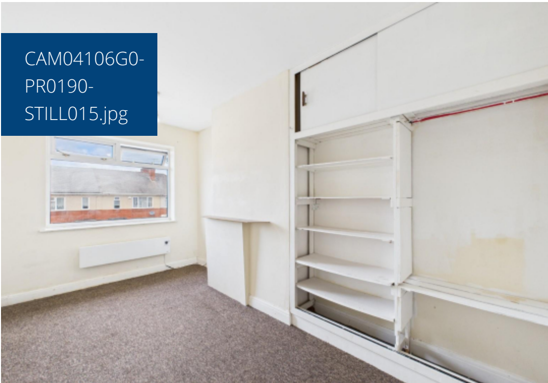
CAM04106G0- PR0190- STILL015.jpg