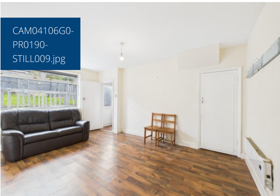
CAM04106G0- PR0190- STILL009.jpg