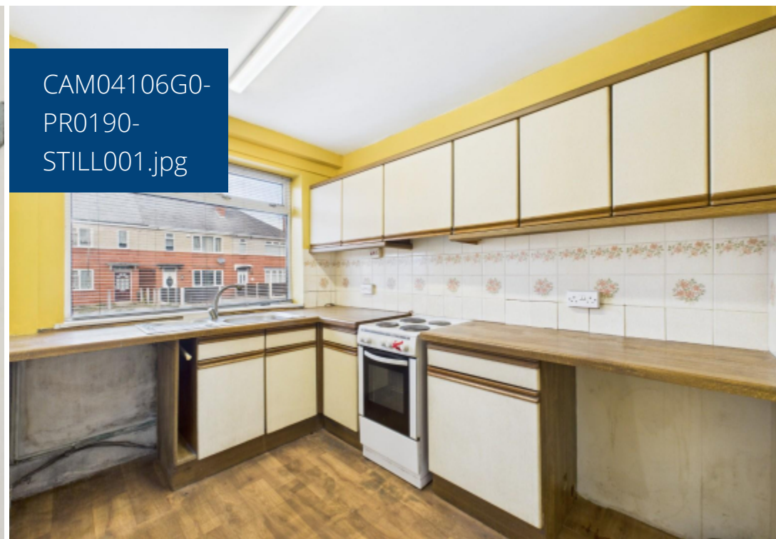
CAM04106G0- PR0190- STILL001.jpg