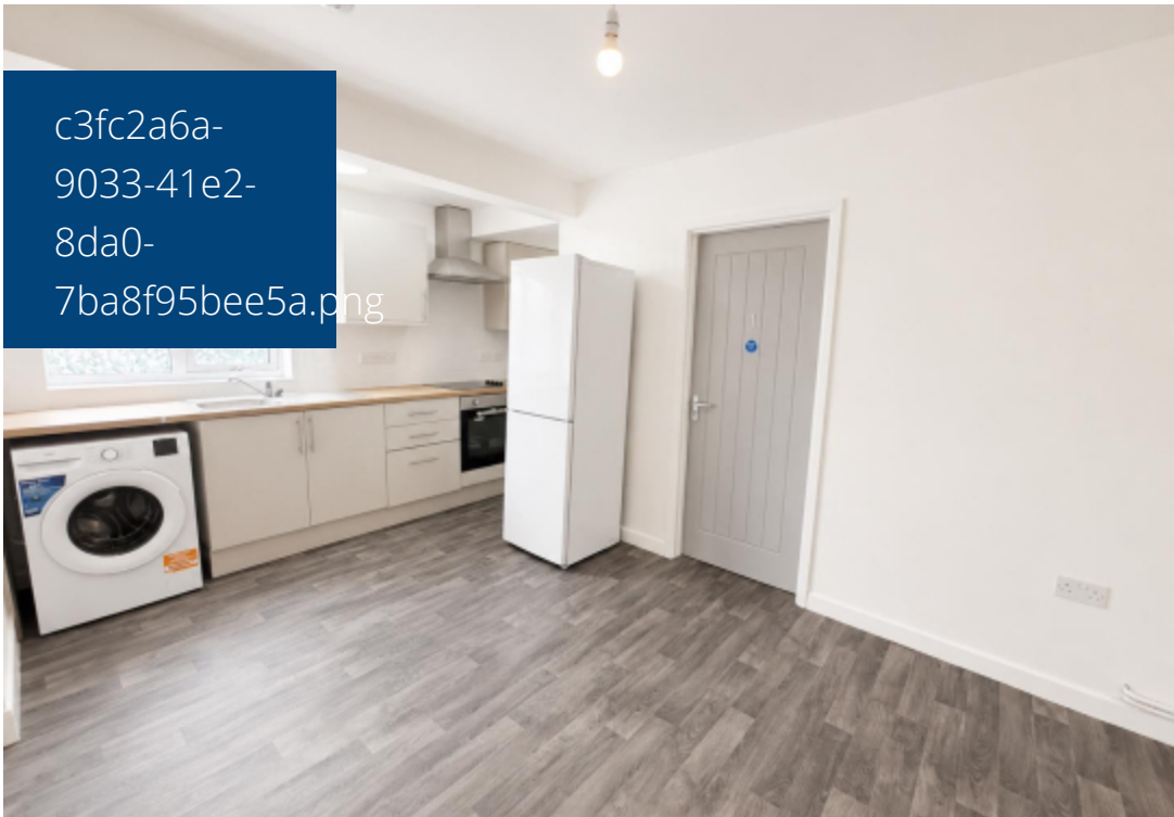
c3fc2a6a- 9033-41e2- 8da0- 7ba8f95bee5a.png