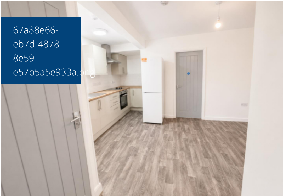
67a88e66- eb7d-4878- 8e59- e57b5a5e933a.png